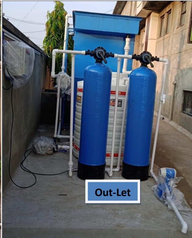
15 KLD STP/ETP